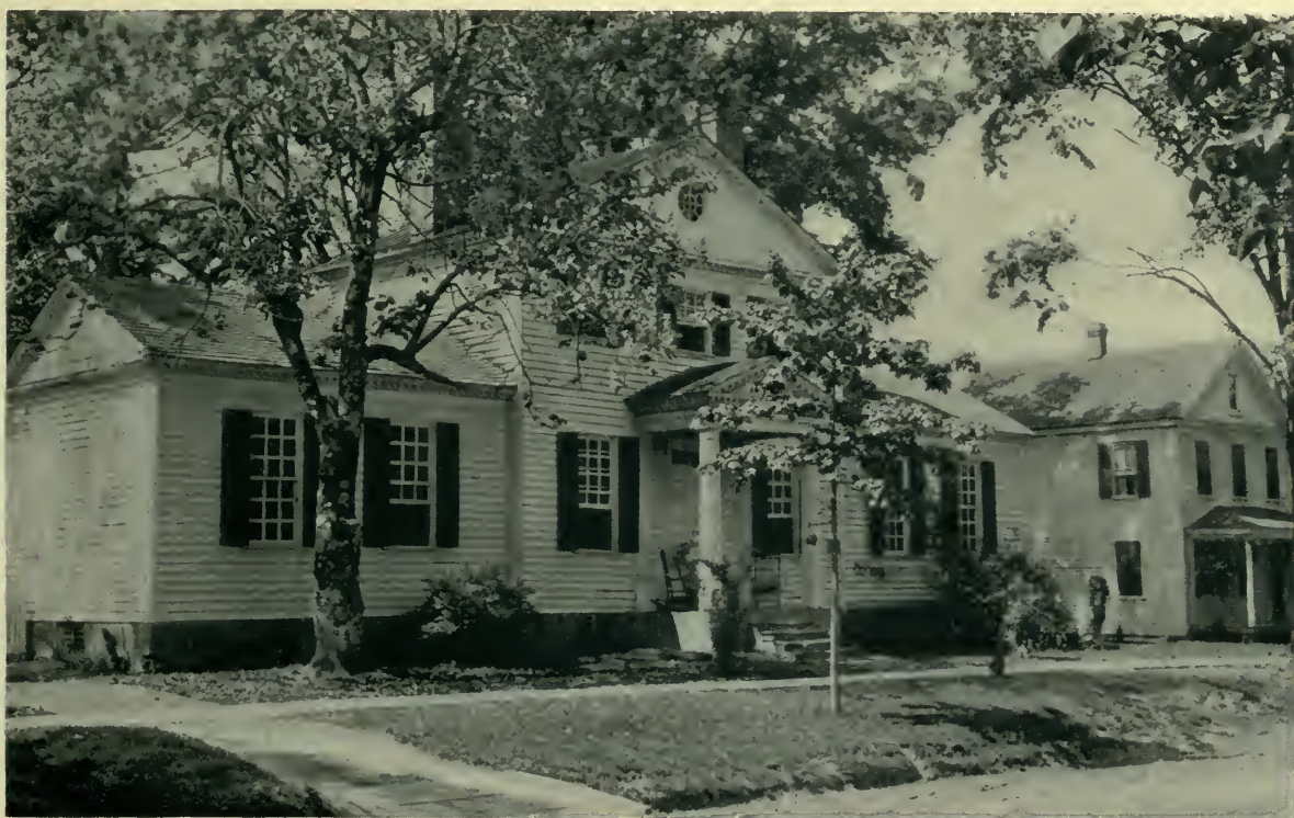
HOUSE OF PEYTON RANDOLPH, WILLIAMSBURG, VIRGINIA Mr. Randolph was the first President of the Continental Congress